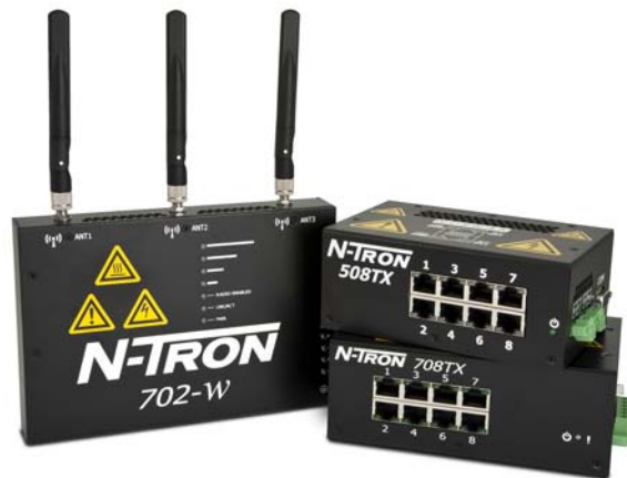
N-TRON Industrial Ethernet Devices

All wired switches in the 700 series and 500-A series include Virtual Local Area Network (VLAN), Quality of Service (QoS), port trunking, port mirroring, and Internet Group Management Protocol (IGMP) snooping. With IGMP snooping, the unit filters and forwards multicast messages to reduce network traffic, which is a requirement on networks with EtherNet/IP™ devices (such as Allen-Bradley® RSLogix®-based PLCs).